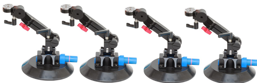
4 x Suction Cups with Rosette Extension Arms