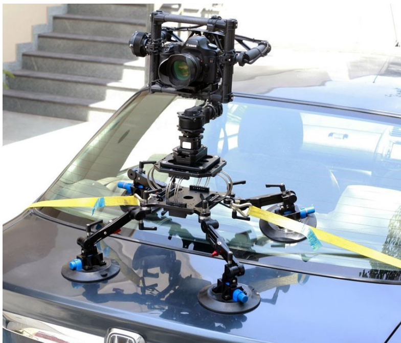
(SHOWN WITH OPTIONAL ACCESSORIES)