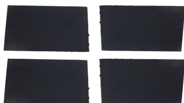
4 x Rubber Sleeves