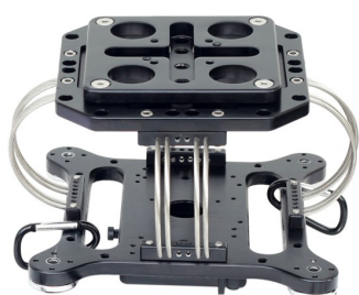
Gimbal Vibration Isolator

Please inspect the contents of your shipped package to ensure you have received everything that is listed below.