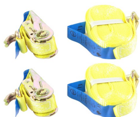
2 x Safety Belts