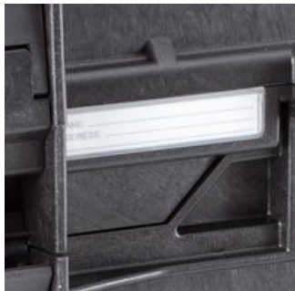
PVC waterproof ID removable label