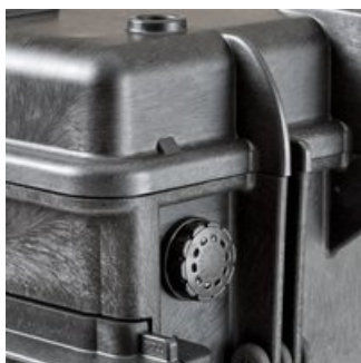
Automatic pressure release valve.