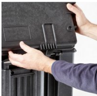
By releasing the screw both, the top and front lids can be slide off.