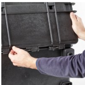
By releasing the screw both, the top and front lids can be slide off.