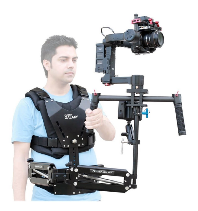
(SHOWN WITH OTPIONAL ACCESSORIES)