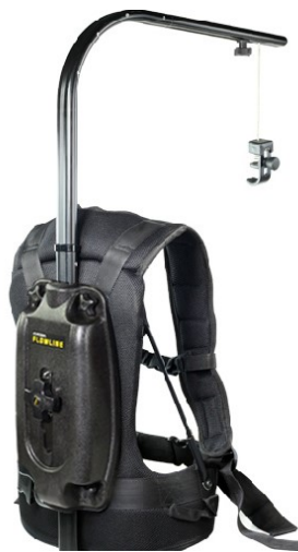
Flycam Flowline Camera Support Rig

Please inspect the contents of your shipped package to ensure you have received everything that is listed below.