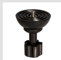
75BF 75mm Ball to Flat Adapter