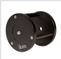
IK-RSR3 3" Camera Riser