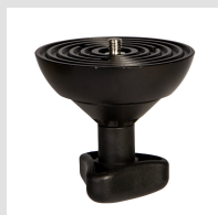
100BF 100mm Ball to Flat Adapter