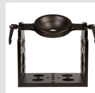
IK-RSRS 6" Camera Riser Hi-Hat with Swivel