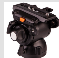
GH03F Flat Base Pro Fluid Head 11 lbs Max