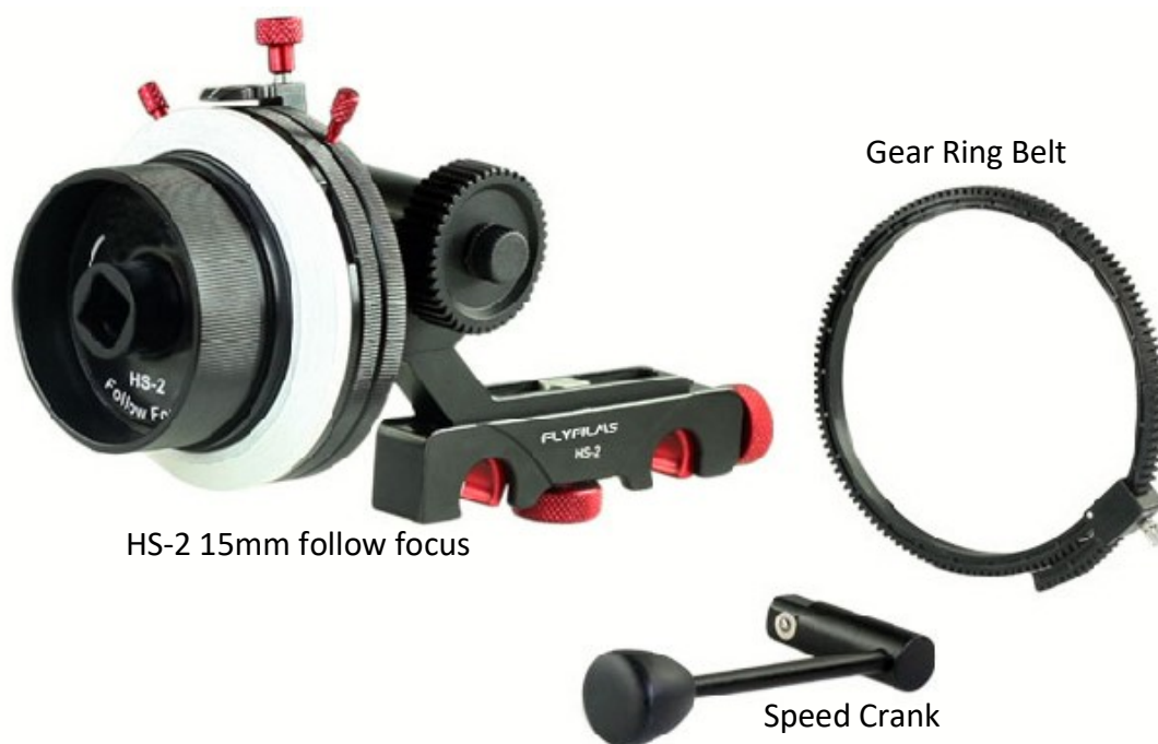
HS-2 15mm follow focus

Please inspect the contents of your shipped package to ensure you have received everything that is listed below.